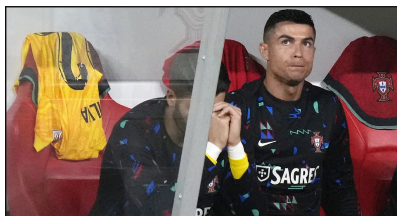
Portugal's Cristiano Ronaldo, right, sits on the bench during the UEFA Nations League soccer match between Portugal and Scotland at the Luz stadium in Lisbon, Portugal, Sunday, Sept. 8, 2024.

Ronaldo's debut in the Elite tournament could now come