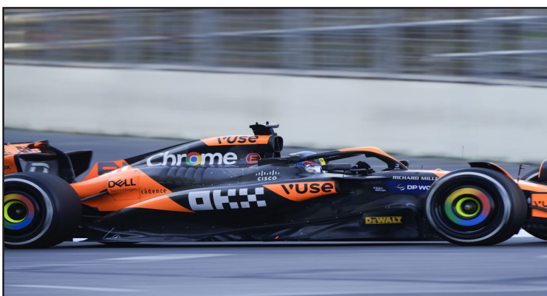
McLaren driver Oscar Piastri of Australia in action during a Formula One Grand Prix in Baku, Azerbaijan, Sept 15, 2024.

BEIJING (Reuters) - McLaren's Oscar Piastri withstood heavy pressure from Ferrari's Charles Leclerc to take victory in Sunday's Formula 1 Azerbaijan Grand Prix, as the race ended under caution after a penultimate lap tangle between Carlos Sainz and Sergio Perez.