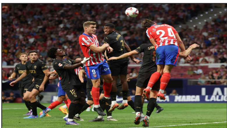
Atletico Madrid's Norwegian forward #09 Alexander Sorloth, Atletico Madrid's Spanish defender #24 Robin Le Normand and Valencia's Spanish defender #03 Cristhian Mosquera jump for the ball.

Alexander Sorloth, another summer signing for Diego Simeone's revamped side, also created a couple of dangerous chances only to be