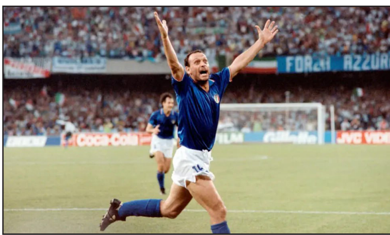
Salvatore Schillaci scored six goals in seven appearances at the 1990 World Cup

Schillaci scored his first goal of the 1990 World Cup as a substitute against Austria, and after another substitute appearance