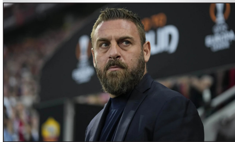
Roma's head coach Daniele De Rossi waits for the start of the Europa League second leg semifinal soccer match in Leverkusen, Germany, May 9, 2024.

ROME (AP) — Roma fired coach Daniele De Rossi on Wednesday in a move that was surprising despite the Giallorossi going winless in their opening four Italian league matches.